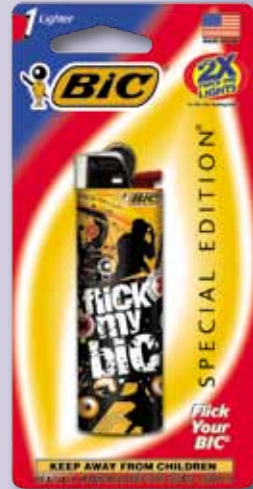
BIC® Special Edition® Lighter 1-pack (reg. 84c)