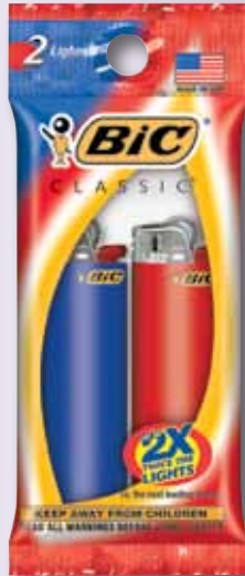
BIC® Classic® Lighter 2-pack (reg. $1.39)