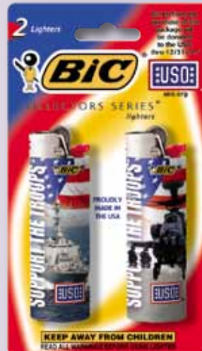
BIC® Collectors Series® USO Support the Troops Lighters 2-pack (reg. $1.75)