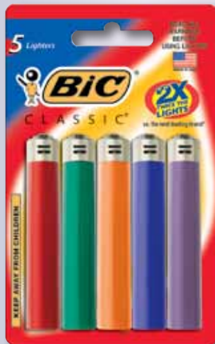
BIC® Classic® Lighter 5-pack (reg. $3.24)