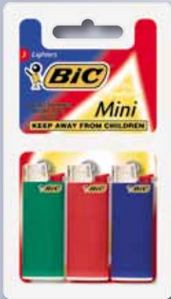
BIC® Mini Lighter 3-pack (reg. $1.49)

Sale prices effective: January 1-31, 2013