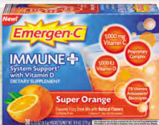
Emergen-C® Immune + Super Orange; Raspberry - 30 ct.