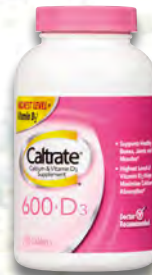
Caltrate® 600+D3 - 200 ct.