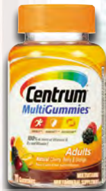
Centrum® MultiGummies - 70 ct.