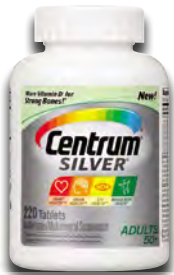
Centrum® Silver Adults 50+ - 220 ct.