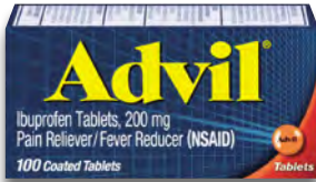
Advil® Tablets - 100 ct.