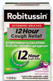
Robitussin® 12 Hour Cough Relief Grape; Orange - 3 oz.