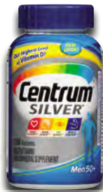
Centrum® Silver Men 50+; Women 50+ - 200 ct.