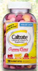
Caltrate® Gummy Bites - 100 ct.