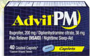
Advil® PM Caplets - 40 ct.