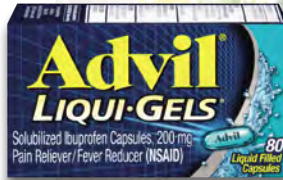
Advil® Liqui-Gels; Film-Coated Tablets - 80 ct.