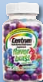
Centrum® Flavor Burst Mixed Fruit or Tropical Fruit – 120 ct.