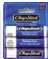
ChapStick® Moisturizer 3 pk. or Regular 3 pk. – .45 oz.