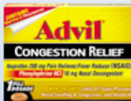
Advil® Congestion Relief Tablets – 10 ct.