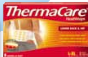
ThermaCare® Lower Back & Hip L/XL 8 hr. – 2 ct.; Lower Back & Hip S/M – 2 ct.; Neck to Arm – 3ct.; Knee & Elbow – 2 ct.