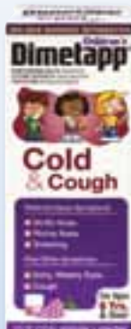
Dimetapp® Cold & Cough – 4 oz.