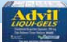
Advil® Liqui-Gels® or PM Caplet– 80 ct.