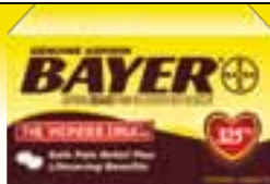
Genuine Bayer® Aspirin 325 mg. 100 ct.