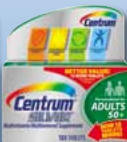
Centrum® Silver® Adults 50+ – 125 ct.