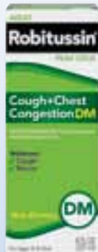
Robitussin® Cough+Chest Congestion DM; Cough+Cold Child; Peak Cold Nighttime Multisymptom; Peak Cold Sugar-Free Cough+Chest Congestion DM – 4 oz.