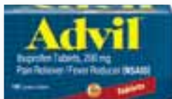
Advil® Tablets – 100 ct.