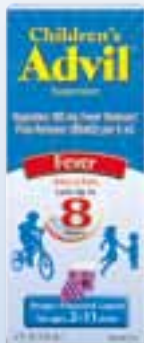
Children's Advil® Suspension Grape- Flavored; Fruit; or Blue Raspberry – 4 oz.