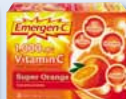
Emergen-C® Vitamin C Dietary Supplement Super Orange; Raspberry; Tangerine – 30 ct.