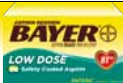
Regimen Bayer® Aspirin 81 mg. 120 ct.