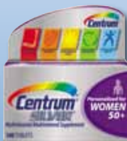
Centrum® Silver® Women or Men 50+ – 100 ct.