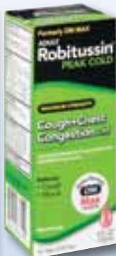
Robitussin® Maximum Strength Cough+Chest Congestion DM – 4 oz.