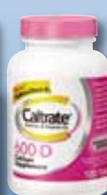
Caltrate® 600+D – 120 ct.